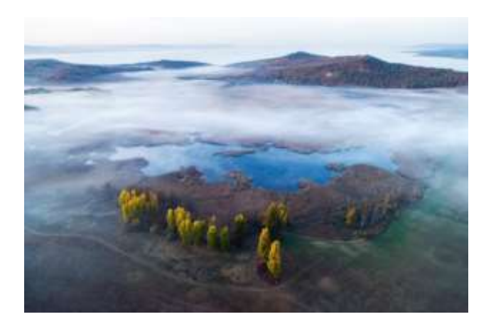
Autumn morning at Lake-Külső / Balaton-highland National Park (Magical Hungary)

PHOTO EXHIBITION – Selection of photos of "Magical Hungary"