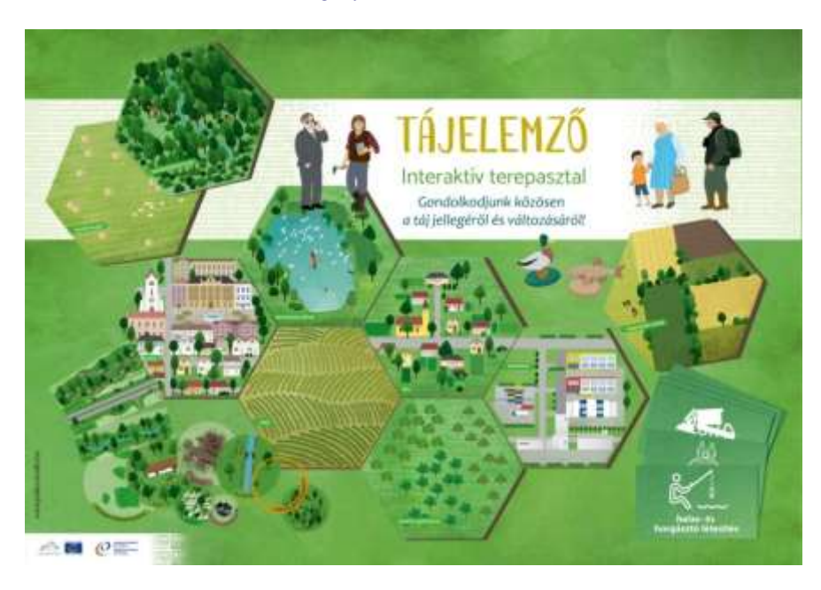
Let's think together on landscape character and change of it! (Ministry of Agriculture – Patkós Stúdió)